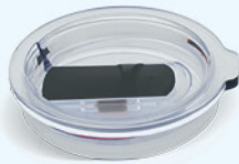
Threaded Tritan Slider