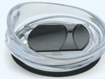
Push-On High Profile Slider