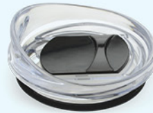
Push-On High Profile Slider